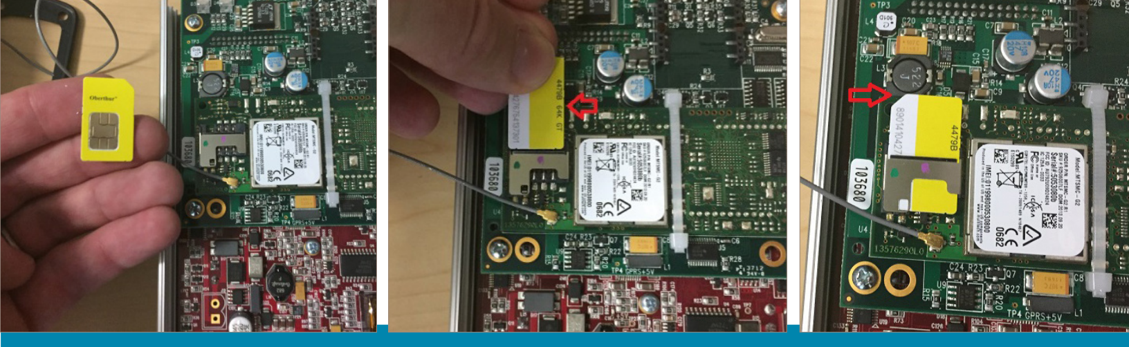
Figure 6: Replacing the SIM card with one from your own local carrier