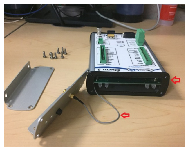
Figure 3: Showing plate with antenna attached, and the rubber gasket

Once the plate is pulled away, slide the rubber gasket down the cable so that it is loose from the main case.