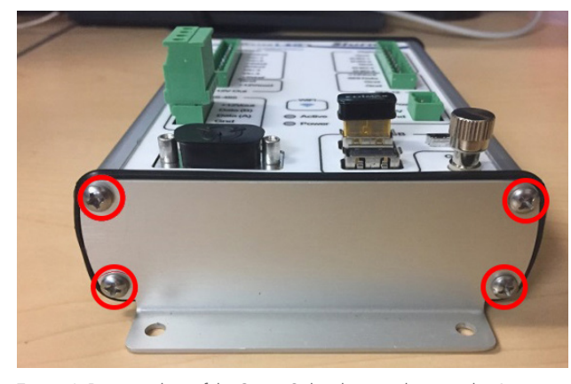
Figure 1: Bottom plate of the Storm 3 data logger showing the 4 screws