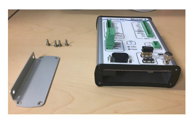
Figure 2: Bottom plate and four screws removed