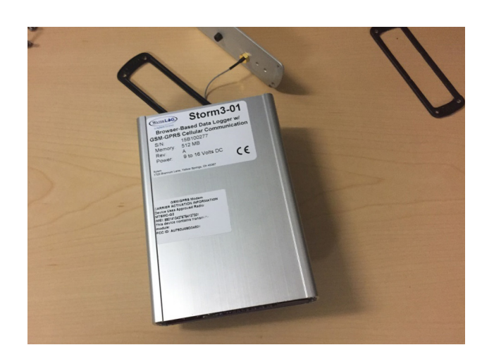
Figure 7: Begin reassembly of Storm 3

Slide rubber gasket into place (Figure 8) then slide top mounting plate in place lining up the 4 screw holes with the holes in the case. Insert the 4 screws and start them but do not tighten them all the way yet. If screws are too tight you will have trouble lining up the screws for the bottom plate in the next step.