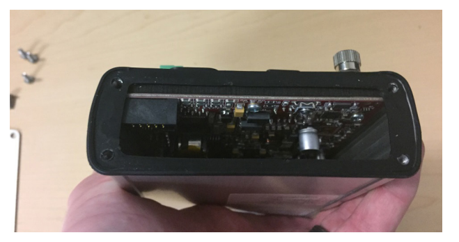
Figure 9: Place rubber gasket onto bottom

Flip the Storm over and place the rubber gasket on the bottom side into place (Figure 9).