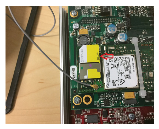
Figure 5: SIM card location on modem board

Locate the SIM card on the green modem board just above where the antenna cable connects to the board (Figure 5).