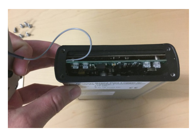
Figure 8: Slide rubber gasket into place

Slide rubber gasket into place (Figure 8) then slide top mounting plate in place lining up the 4 screw holes with the holes in the case. Insert the 4 screws and start them but do not tighten them all the way yet. If screws are too tight you will have trouble lining up the screws for the bottom plate in the next step.