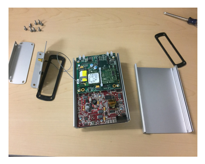
Figure 4: Storm 3 case separated

Separate the two halves of the main Storm 3 case by carefully pulling them apart (Figure 4).