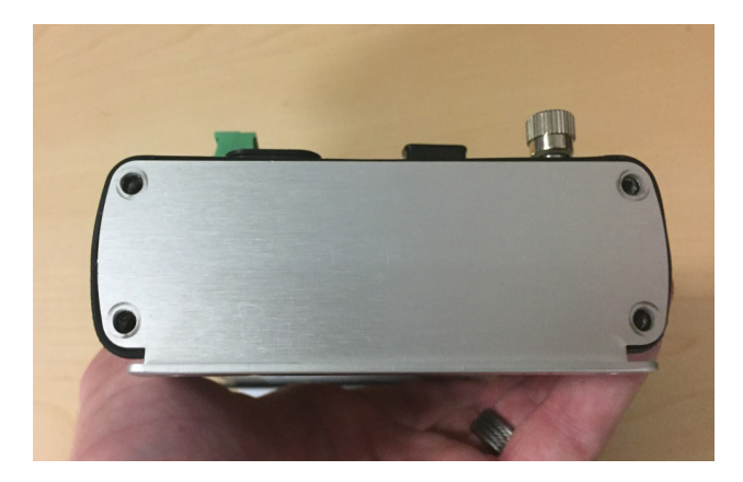
Figure 10: Bottom mounting plate lining up with the holes

Insert the 4 screws and tighten until snug.